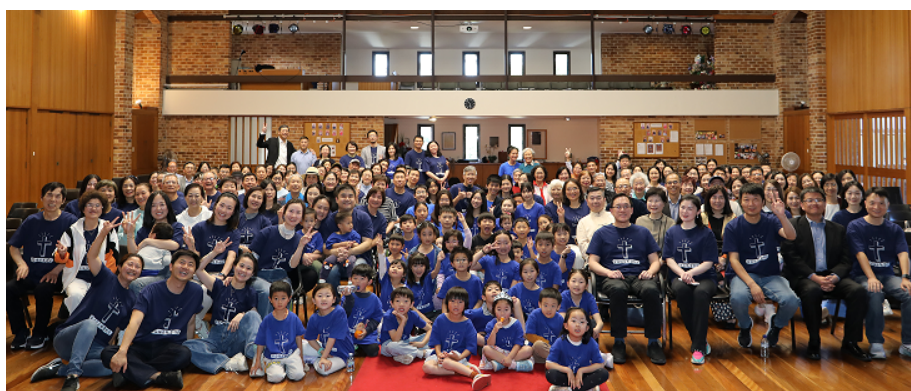
29/10 EFC of Glory 1st Year Anniversary Thanksgiving Service