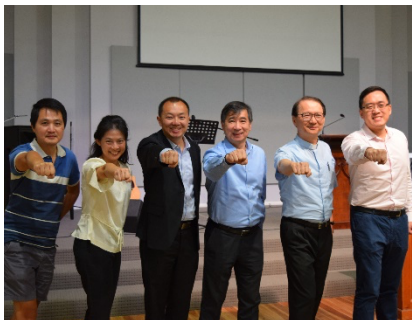
12/02 GA Representatives