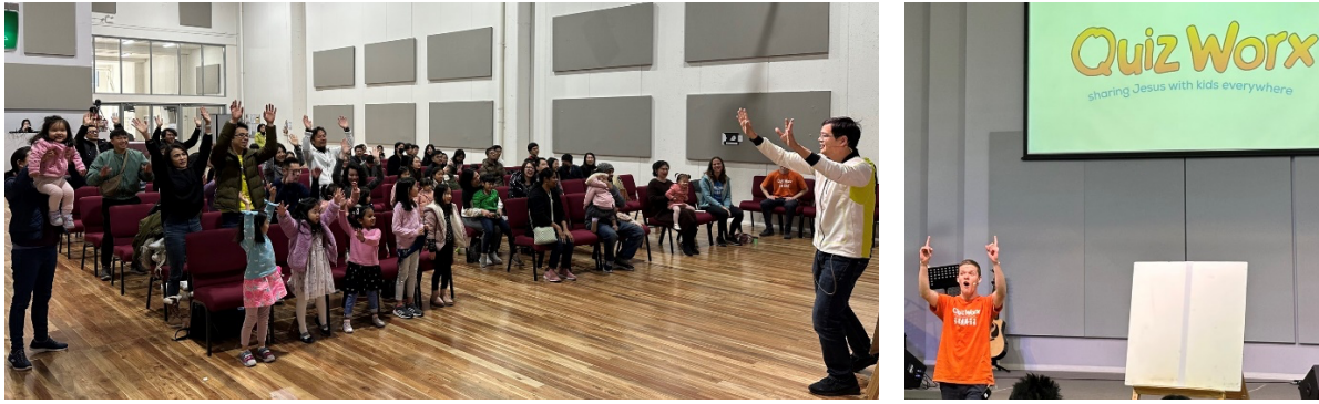
28/05 Quiz Worx at English Service

grow the next generation youth group, and make the Sunday service more interesting, interactive and appealing to the target audience.