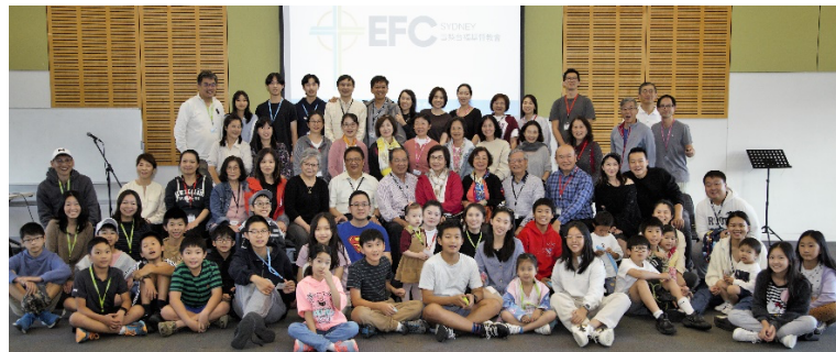
08/04 Easter Camp: 「生命重啟，與主同行」

在我們敬愛的主任牧師陳文禮牧師的帶領下，我們在 2023 年 8 月 1 日正式聘任王耀輝傳道在本會全職事奉。願我們每一位弟兄姊妹都能跟隨聖靈的引導，跟牧者團隊同心合意興旺福音。